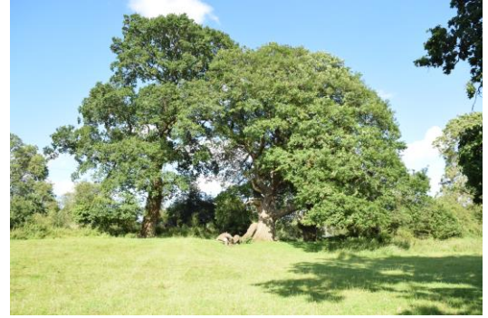
Some of the mature oak trees over the Fiery Fields

Grade : A short walk, on foot paths, lane and bridleways, with 92 ft vertical gain. One small section that may be muddy after rain; not suitable for push chairs.