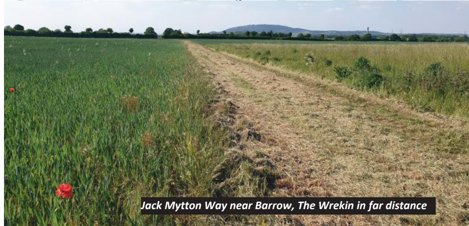
Jack Mytton Way near Barrow, The Wrekin in far distance