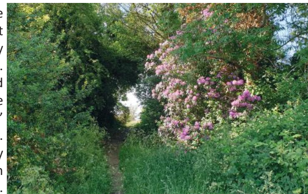
The start of The Jack Mytton Way by the B road in Barrow is opposite the lane to the church

The path keeps close to the hedge going downhill; you'll get excellent views towards Benthall and Broseley ahead and The Wrekin to your left. In about 500m you come to the field corner, look for a hole in the hedge and the start of a 'green tunnel path' between two hedges on your right. After 400m you reach the Broseley to Much Wenlock B road, you turn left and walk back into Posenhall. The bus stop is a few metres further on, the tea rooms about 150m.