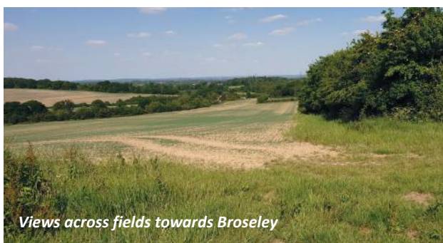
Views across fields towards Broseley

The going gets easier and you soon get a glimpse of Barrow School up the hill on the right hand side. You exit the bridleway onto the B road. Take care, it isn't usually busy but cars can be driven very fast along here. After about 200 metres at the Barrow village sign there is a welcome verge and footway on the left side of the road. You can't see the old school from the road anymore as it's hidden by trees but you can see a row of old almshouses on the left, all were built in 1818. The rest of the hamlet of Barrow is hidden behind the church. Take the small lane on the left to visit the ancient Grade 1 listed church.