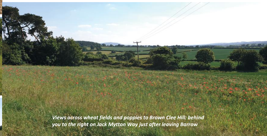
Views across wheat fields and poppies to Brown Clee Hill: behind you to the right on Jack Mytton Way just after leaving Barrow

Walk around the back of the church and exit through a small churchyard gate back onto the lane where you left the B Road. Cross straight over the road to join The Jack Mytton Bridleway between two hedges. This becomes a clear broad track which you follow across fields for 800m. Cross straight over the B4375 Broseley to Much Wenlock Rd and continue to a gate, where go straight on through the gate. (ignore the bend to the left here). To continue to Wkye, you stay on the Jack Mytton Way and walk straight on for another 1km to join the lane to Wyke (follow directions on the Posenhall to Wyke circular walk from this point.) To return to Posenhall turn immediately right through a small kissing gate.