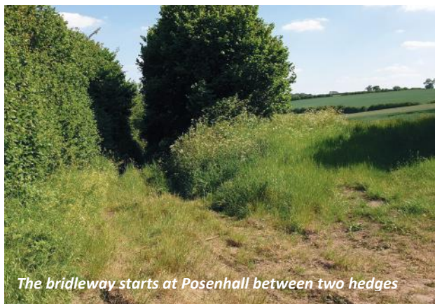
The bridleway starts at Posenhall between two hedges

Follow the bridleway for about 1km. It can be a bit overgrown at first but it does get better, one consolation is that butterflies and birds seem to like it this way! In very wet weather watch out for deep puddles in the middle section, keep to the left side. The views through the gaps in the hedge are great, you can see across fields to Broseley, All Saints Church and Willey Park estate woods to the left.