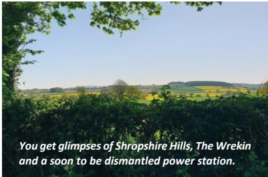
You get glimpses of Shropshire Hills, The Wrekin and a soon to be dismantled power station.

This section follows purple waymark arrows. Walk up the lane past the burial ground and Benthall Hall Farm straight on along a bridleway track for about 500m. If you look to your left you'll get wonderful views of the Shropshire Hills on a clear day, including the highest point in the county Brown Clee (pick your weather carefully.) At the end of the bridleway where the track curves right go straight on through a metal gate and immediately right through a small gate and into Benthall Edge Woods between two deep dips made by old limestone quarries. In the woods you'll enjoy glimpses through trees of The Wrekin and Ironbridge Gorge and old yew trees among newer growth.