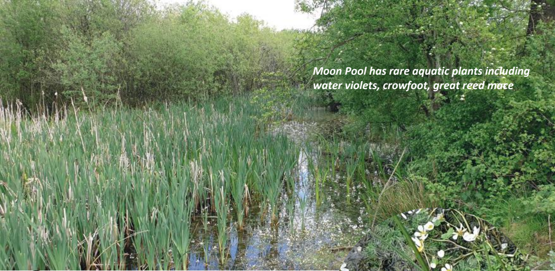
Moon Pool has rare aquatic plants including water violets, crowfoot, great reed mace