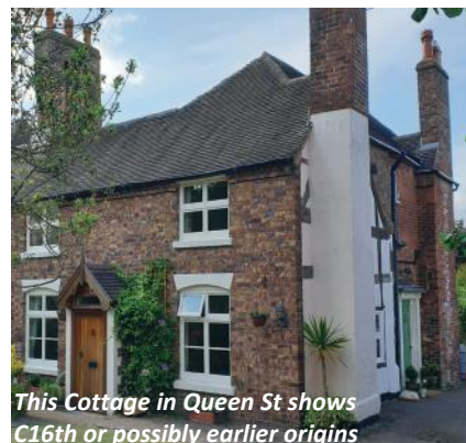
This Cottage in Queen St shows C16th or possibly earlier origins

To see part of 'old Broseley' 100m after the track curves right past the disused farm, look for a gap in the hedge to take a narrow steep path down through a small rough field to Bridge Road. Cross the road walk into Plants Jitty (almost opposite slight left). then straight on up Legges Hill, and turn right into Kings St. Go straight on, you'll pass the Pipe Museum on your left, (peer through the window). Turn left down Queen St, then right into Duke St to come back to Broseley High St where you turn left to return to the car parks.