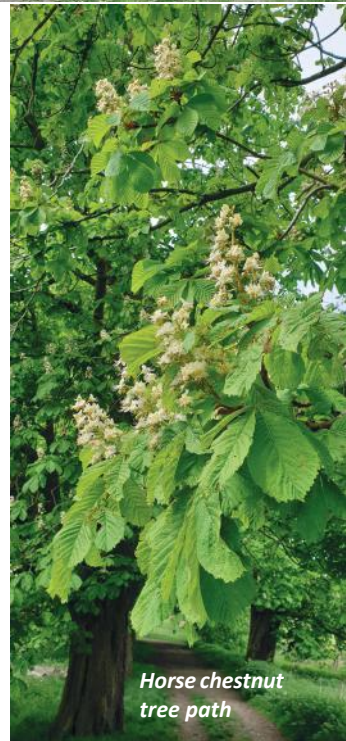
Horse chestnut tree path