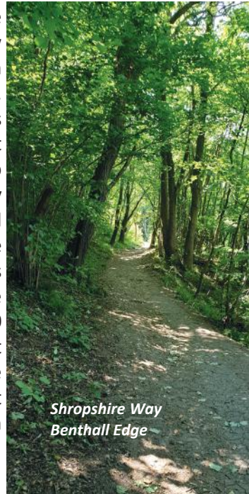
Shropshire Way Benthall Edge

Start from the library car park and bus stop, or park near the Pipe Museum or even better use the bus, the stop is a few metres past the museum entrance in King St. You can return from Much Wenlock by bus if you don't want to walk back. Walk up High St, turn right down Barber St which becomes Duke St. Just after the Pipe Museum entrance bear right at the junction into King St and then turn left down the steep Legges Hill lane. At the bottom turn right into the very pretty Simpsons Lane past Broseley House. Continue straight on and at the end, just before the old post office, now a private house, go left down Jews Jitty, a narrow stepped path. Cross straight over Bridge Road and walk up The Mines opposite and continue straight on into Spout Lane which in about 250 metres becomes the Spout Lane bridleway. You'll soon get beautiful views across fields and the wooded Ironbridge Gorge. In 500m you will enter the Benthall Edge woods. Just past the gate and stile is a path junction, take the wide path straight on gently uphill signed to Benthall Hall.