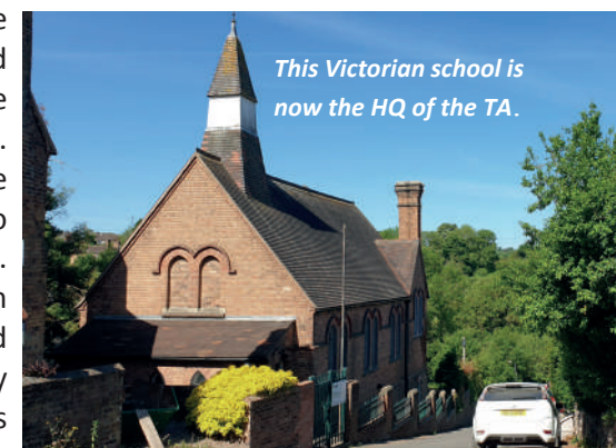
This Victorian school is now the HQ of the TA.

We recommend starting from Broseley Pipe Museum in Duke St in the centre of town, it is well signed; street parking is usually available (the car park is for museum visitors and residents only). The route described goes direct to the Hall and is very scenic. It takes you through part of Broseley Wood via one of the famous jitties. With your back to the museum entrance turn left and walk straight on past the road junction, after 50m turn left down the steep Legges Hill lane past an old school. The cottage on the right used to be The Nelson pub. At the bottom of the hill go straight on and walk down Plants Jitty. When you emerge onto Bridge Road turn left and cross the road to follow the signed footpath opposite. The path goes steeply uphill across a small field with the remains of shallow mines worked for coal and clay, in operation until the end of the C19th.