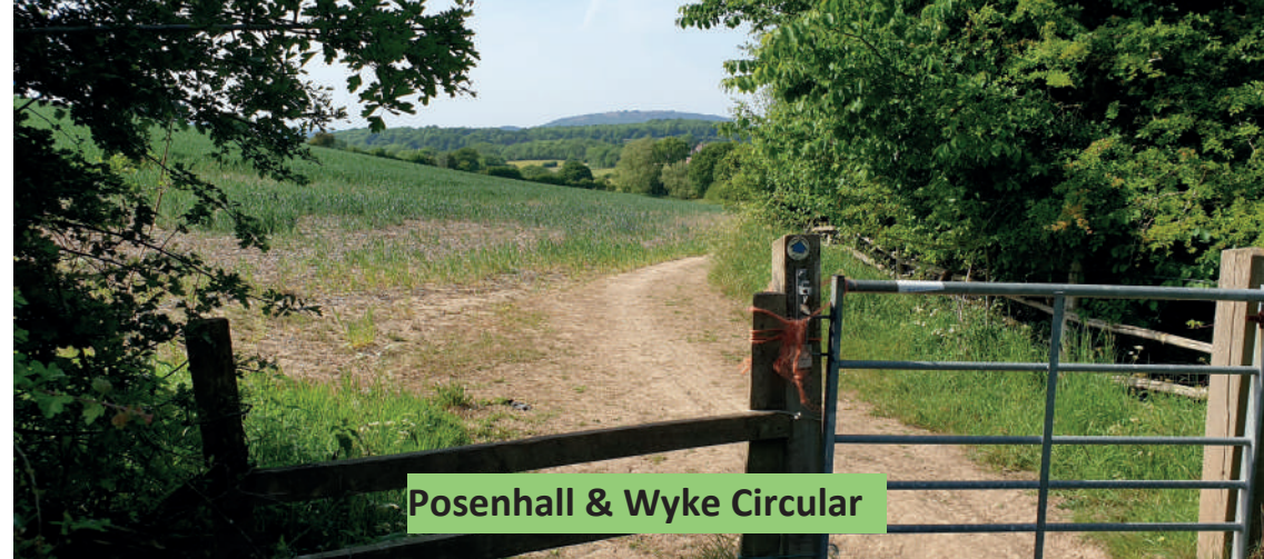
Posenhall & Wyke Circular

5.5 miles / 9 km: field edge paths, quiet lanes and 'green tunnels' NB short stretch of B road (care!) 7 stiles, some livestock. Vertical gain 328 ft / 100m