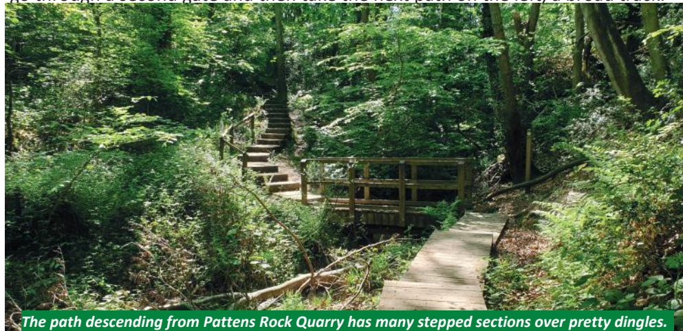
The path descending from Patten's Rock Quarry has many stepped sections over pretty dingles.

You pass disused quarry workings and kilns as the path climbs, on old tramway with a steady gradient, through beautiful woodlands. You get glimpses of Ironbridge, the Severn, Steethill and The Wrekin to your right between trees. Eventually you come a metal kissing gate and a large finger signpost. Take the path signed to Benthall Hall. (If you are a masochist or want a workout you can take the stepped route direct to Patten's Rock, beware, over 400 steps and counting and it's pretty steep! There is a bench here if you need to take a rest and a few deep breaths before you attempt it.) Continue straight on, go through another small metal kissing gate and walk uphill following the Shropshire Way. After about 800m just after where the path dips between two old quarries, you exit through a small gate, turn left and go through a second gate and then take the next path on the left, a broad track.