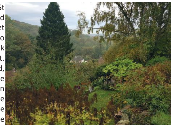
View of Benthall Edge Woods from Quarry Rd

Start Broseley Pipe Museum in Duke St (the car park is for museum visitors and some residents only but limited street parking is available.) With your back to the museum entrance turn left and walk straight on bearing right into King St. Take the second road left, Quarry Road, walk down hill to Bridge Road where you turn right and continue down towards Ironbridge. You will see the Bridge Bank footpath into Benthall Edge woods on the left, opposite where the footway bends away from the road.