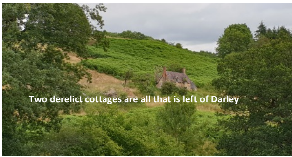
Two derelict cottages are all that is left of Darley

Cross the B road, go straight on down the lane. Climb the stile at the end of the Honeypot cottages, continue for about 50 m and take a narrow path on the left leading steeply down through woods for 100 m and turn left at the gate. Cross the field in front of you, keep the ruins of a small square building to your left (there are abandoned cottages in each adjacent field on the right.) At the bottom bear left and cross a stream, (at times the flat wood bridge is under water, but fordable), bear right and walk steeply uphill across some rough hummocky ground, aim for the gate and stile in the top right corner of the field, keep the hedge to your right do not follow the track leading to the abandoned building, there is no right of way to them. You have just crossed the site of the abandoned village of Darley, first mentioned in 1342; by 1609 there were several cottages on the site of possibly a C13th hamlet. In the 1780s the nearby saggar works using local clay closed then riverside areas lost their importance when the railway arrived in 1862 and people moved away. By 1911 Darley was just two residences and it was no longer recognisable as a hamlet by the 1980s.