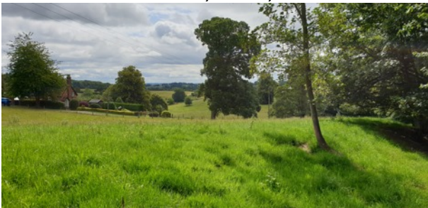
View to the east where you leave the bridleway near Willey Park Take advantage of gaps in the trees to glimpse extensive views and to watch for buzzards soaring on section 2 of the walk.