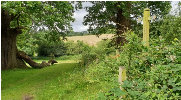
Bridleway through Fiery Fields

There may be animals grazing in the fields, so please follow NFU and Ramblers guidance on walking near livestock, especially with dogs near cows with calves and stay on rights of way paths. Go straight on through the gate at the end of the fields, follow a wide path and in 400m you will come to Lodge Lane, where you turn left.