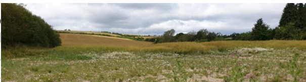
View to west near Lodge Lane Farm

Follow Lodge Lane until you come to the B4376 where you cross the road and turn left. There is no pavement, only a narrow verge, take care here. Descend the road for about 350 metres, (there's a glimpse of the private road to Willey Park over the bridge parapet on the right). Near the bottom of the dip turn right onto a permissive path through the woods, it forks twice shortly after, take the right fork. After about 250 metres look for a small gate to your left, go through the gate and follow the path up through the meadow keeping the woods on your right. This meadow is a butterfly heaven in summer before the hay is cut. You come to a track, turn right and follow the path past the farm buildings on your right, then straight on through woodland and field edges till you meet the road to Willey Park. This is section is excellent for spotting birds, butterflies and wild flowers, especially during April and May in the woodlands.