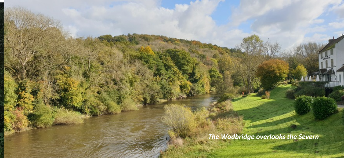
The Woodbridge overlooks the Severn