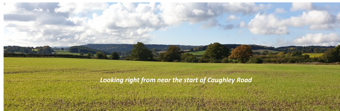
Looking right from near the start of Caughley Road

From Broseley High Street walk downhill into Church St past All Saints Church. Cross Church St then cross the B4373, go straight on down Pound Lane next to the Foresters Arms pub. Pound Lane becomes the Caughley Road, though road is a bit of a misnomer as long stretches are rough track, with gravel, stones and a few muddy puddles. It's popular with walkers, horse riders and cyclists as there are no stiles or gates and the surface is mostly firm. Keep straight on, follow the main track.