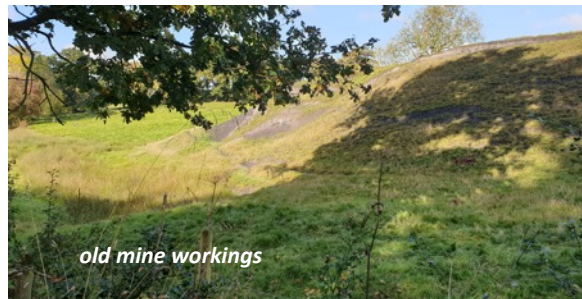
old mine workings

This 800m long lane was heavily used to take lorry loads of coal from the weigh bridge to the B4373 Broseley to Bridgnorth Road till mining ended in 2016. A private road now, for farm and access vehicles only, it is a public right of way for walkers, equestrians and cyclists. As there is no footway along the B4373 road to walk safely into Broseley it's best to use the lane 'as a there and back again walk'. It is worth doing for the views, peace and quiet and, as it is tarmac all the way, it's usable by all including wheelchairs, babies in buggies and kids on scooters and bikes, a safe family walk.