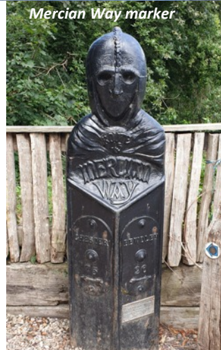
Mercian Way marker

pub is still called the Woodbridge. Immediately after crossing the river turn left along a track, the Silkin Way. Cross the Brewery Inn car park to go through a gate and turn left onto another disused rail line. After 300m you will spot a sign pointing to a cycleway to Jackfield, turn left and walk down through a small car park, a gap in the hedge on the left will bring you out at the Coalport YHA and the China Museum. To your left is an information board and there's a free exhibition in the Coalport Museum shop, so worth a pause to find out more, and to admire the two huge kilns. Many Broseley folk used to work at Coalport. To return to Broseley turn right, walk along the canal (don't miss spotting the Hay Incline at the end on the right). Cross the river at the Memorial Bridge to the Boat Inn at Jackfield.