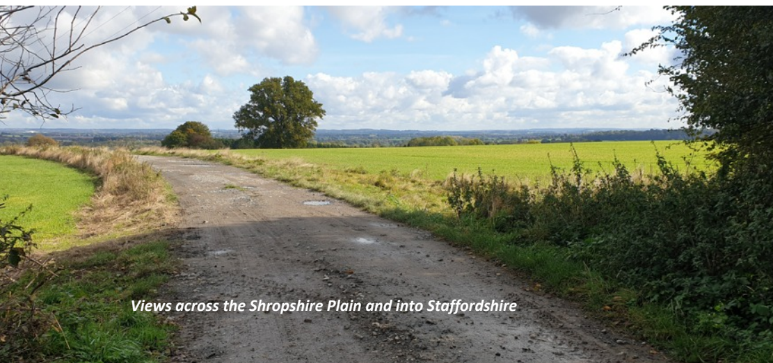
Views across the Shropshire Plain and into Staffordshire