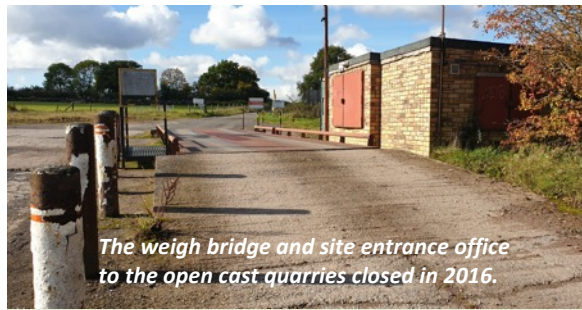
The weigh bridge and site entrance office to the open cast quarries closed in 2016.

Ignore roads and tracks right or left to farm houses along the route, with one exception (pictured right), they are not rights of way. There are glorious wide views of Brown Clee and The Wrekin in the distance to spot through hedgerow gaps. About 100m past Caughley Cottage there is a small monument on the site of the C18th Caughley China Works. You will notice traces of old mine workings in the fields. As you start to descend from the highest point you might see as far as Cannock Chase and the Staffordshire moorlands on a clear day. Eventually you go down a steeper rocky, eroded path between trees. Walk under the disused railway bridge, turn left and walk 50 metres uphill onto a disused railway line and turn right: you are now on part of National Cycleway No 45 between Chester and Salisbury. Continue along the disused railway track past rock exposures in old railway cuttings and woods to your left. To your right is a major sewage works. The Severn is barely visible through the trees though the author once saw an otter here.