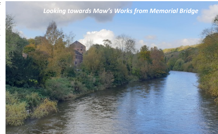
Looking towards Maw's Works from Memorial Bridge

After about 20 minutes of walking you'll see the old Coalport station building and an old vintage railway carriage, now converted for holiday lets. Turn right at the road and cross the Coalport Bridge (look out for the Anglo Saxon Mercian warrior). This was the second iron bridge to be built in the Ironbridge Gorge, to replace an old wood bridge. The riverside